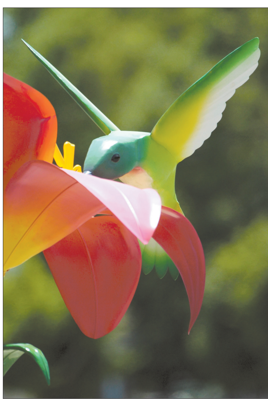
JOURNAL PHOTOS BY BRUCE CHAPMAN

© 2007 Winston-Salem Journal. Reprinted and repackaged with permission, all rights